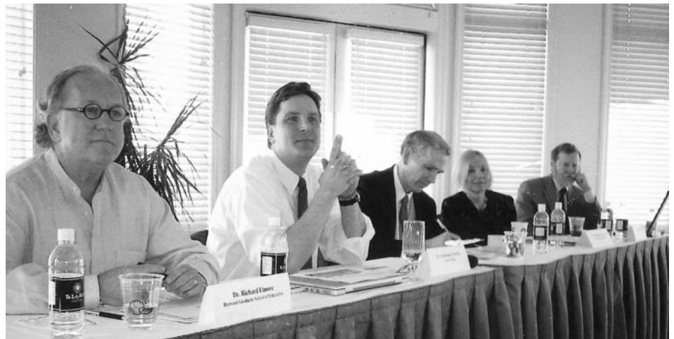
Panel Discussion on Secondary Education with Foundations' Board February 9, 2008

Proposals for "capstone" grants to complete production funding are preferred. Initial research and pre-production funding are seldom supported. Neither multi-year grants nor annual funding of continuing series are normally considered. Recent "capstone" production grants have ranged from $100,000 to $400,000.