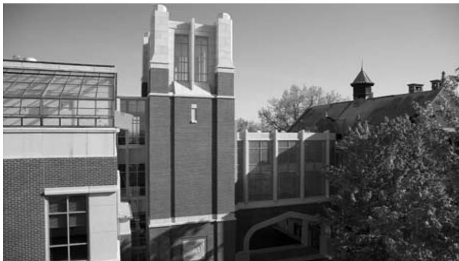
Muhlenberg College, Allentown, PA