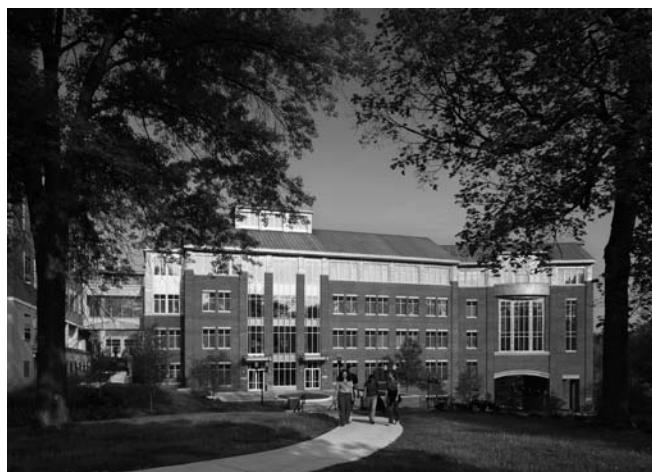
Denison University, Granville, OH

Receipt of a grant under the secondary education program by a private college or university does not affect its chances of receiving a separate grant in the private higher education program category. Only in exceptional cases will proposals be accepted directly from individual secondary schools or school districts. Grants made in this program area range from