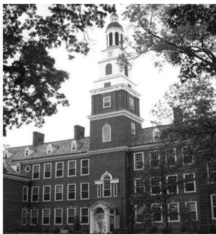
Berea College, Berea, KY

The Bank of New York Mellon serves as corporate Trustee for Foundation No. 2. The SunTrust Banks, Inc. serve Foundation No. 3 in a similar fiduciary capacity. The Foundations' assets are invested in a broadly diversified portfolio consisting primarily of common stocks and bonds. No single company's securities account for more than five percent of the combined total.