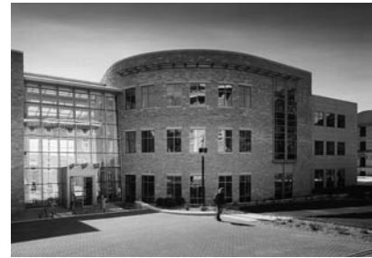
Lawrence University, Appleton, WI

Special consideration will be given to projects in their early stages that address the concerns and problems of secondary education on a national level. Therefore, proposals should strive to develop solutions with potential for wide application or replication by others. Evaluation is often an important component. Requests to support well-established programs should be for initiatives with the potential to improve the program significantly. Proposals should indicate other sources of support for the project, including contributions of