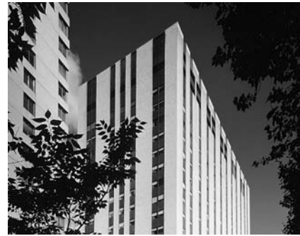
Memorial Sloan-Kettering Cancer Center, New York, NY