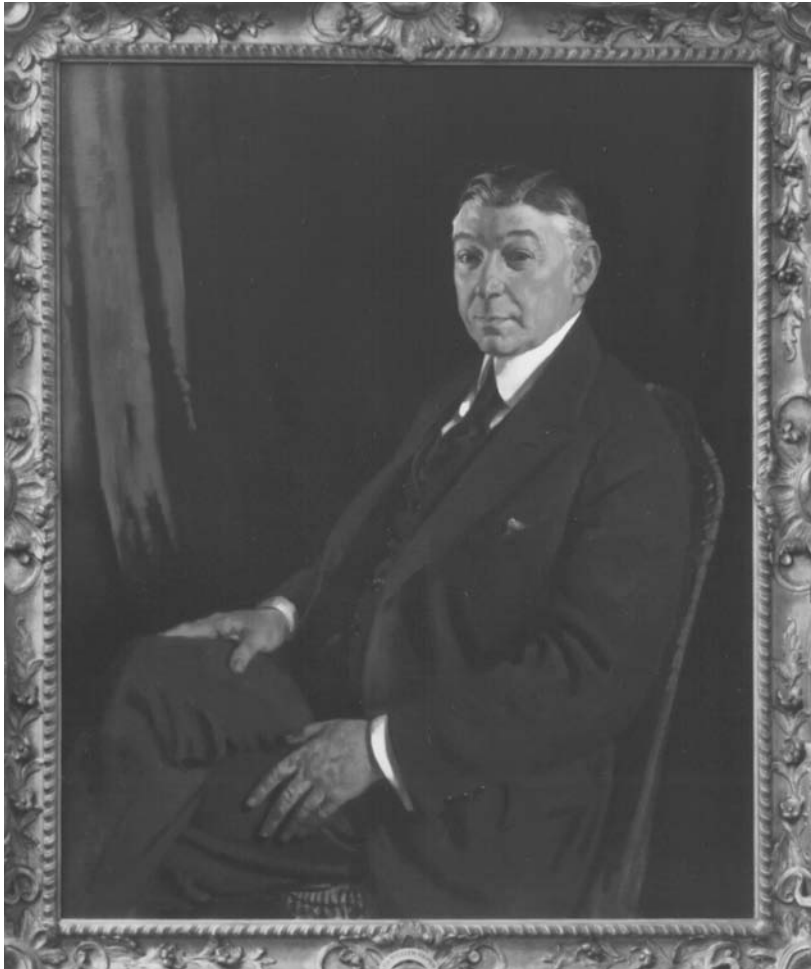
Arthur Vining Davis as painted by Sir William Orpen in 1919.

Mr. Davis' activities were centered in Pittsburgh and New York until 1949 when, at the age of 82, he moved his residence to Florida. Instead of "retiring," he embarked on a new career. While leading Alcoa and serving as director of numerous major corporations, he had become interested in Florida and the Bahamas. During his residence in Florida, he invested in land and other enterprises such as banks, airlines, shipping companies and hotels. When Mr. Davis died in 1962 at age 95, he was one of the best known and respected businessmen in the Southeastern United States.